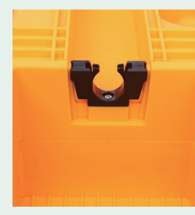
Automatic clamping device Lifting rod automatically locks after putting in